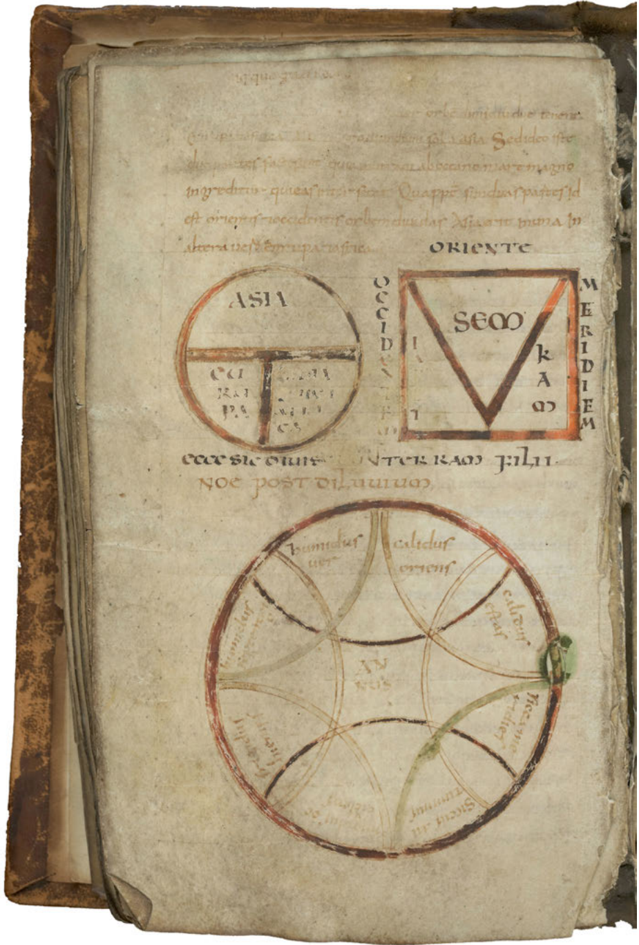
Fig. 5: A V-diagram next to a T-O diagram (dated before 811) (Rouen, Bibliothèque municipale, MS 524, fol. 74v)