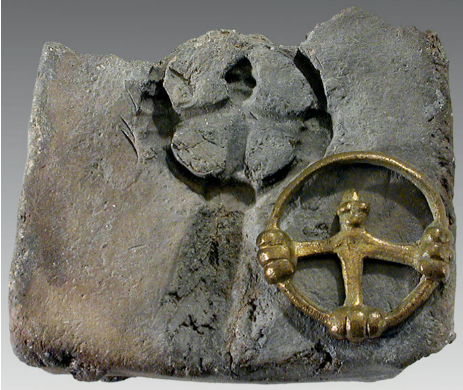
Fig. 4: The 'cross of Spandau' (Berlin, Staatliche Museen zu Berlin, Museum für Vor- und Frühgeschichte, DP 11329)

pendant, may have adopted earlier (non-Christian) traditions. 76 But with its striking design, the 'cross of Spandau' bears a close resemblance to T-O diagrams, though we cannot know for sure if such a link was intended or made by contemporaries.