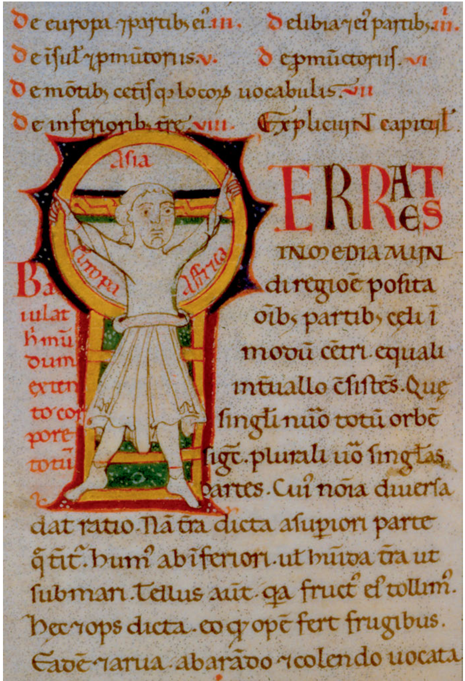
Fig. 3: An illuminated T-initial from a thirteenth-century 'Etymologiae' manuscript (Florence, Biblioteca Medicea Laurenziana, Conv Soppr. 319, fol. 90v)